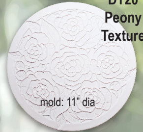
DT20 Peony Texture