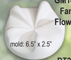
GM140 Fan Flower