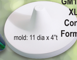
GM139 XL Cone Former