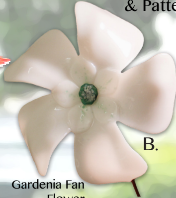
Gardenia Fan Flower